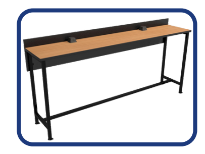
72" Powered Dining Counter