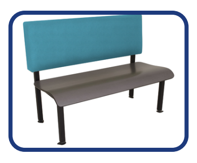
47" Horizon Booth