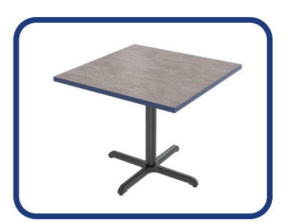
Thin Profile Dur-A-Edge Table

Creating a space in convenience store that blends functionality, and comfort is essential in creating a relaxing and positive environment. Fixed seating and free-standing tables and chairs offer flexibility in seating options.