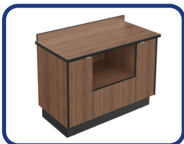
Single Microwave Cabinet

Lounge Seating: Ability to relax in soft seating.