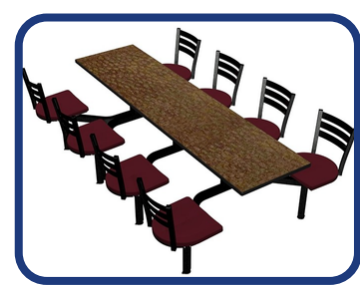
Cebra 8 Seat Quest Dur-A-Edge