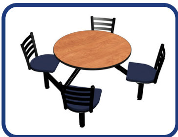
Jupiter 4 Seat Quest

Communal Dining Counter: Powered, so able to use technology if needed. Creates additional seating without taking up too much floor space.