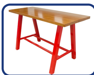
Atlas 72" Communal Table