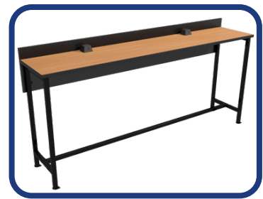
72" Powered Dining Counter