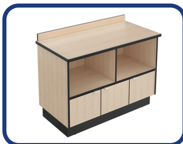
Double Microwave Cabinet