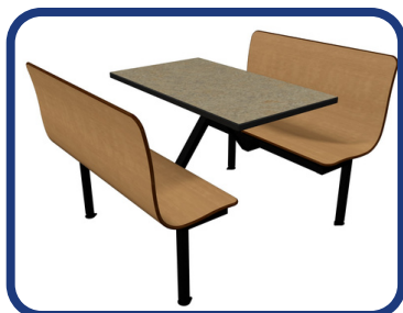
47" Contour Booth

Casegoods: To help keep the breakroom clean and organized.